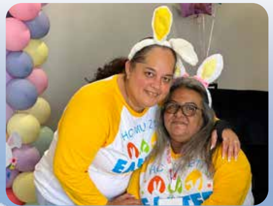
(Above) TXMGMT at the 2024 Easter Event.