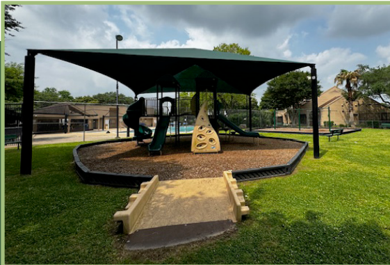
Mission Bend Estates Park – 14730 Mission Hills Drive

We have two beautiful parks for the community to enjoy. Both parks have picnic tables, swings and covered playgrounds.