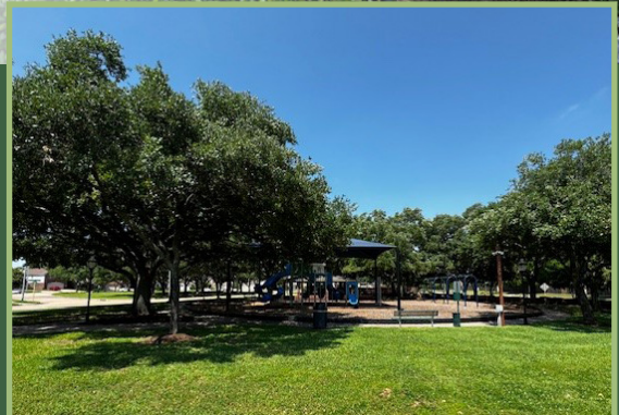
Jack Crook Park – 15234 Corona Del Mar